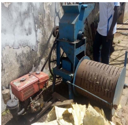
Fig. 5. Picture of the fabricated palm kernel shelling machine