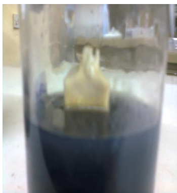
B- Sucker explant