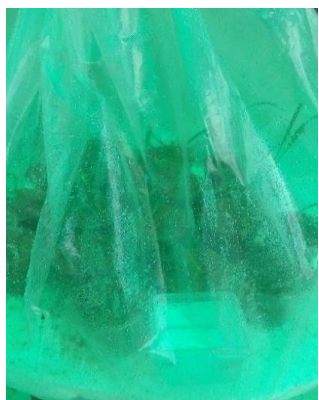
I- Plant Acclimatization