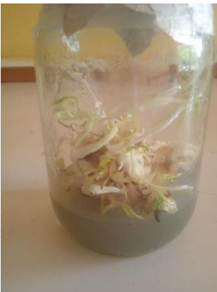
F- Shoot development