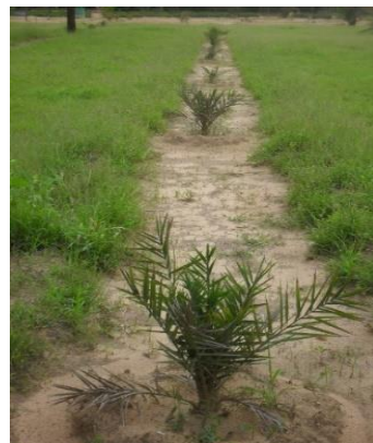
K- Plant in the field