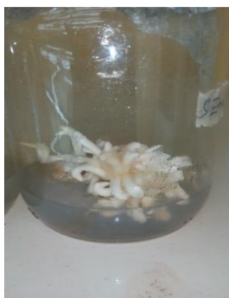
E- Embryo multiplication