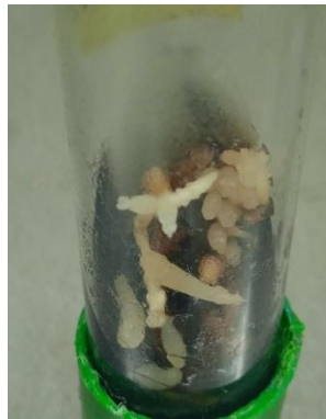
C- Callus response from inflorescences