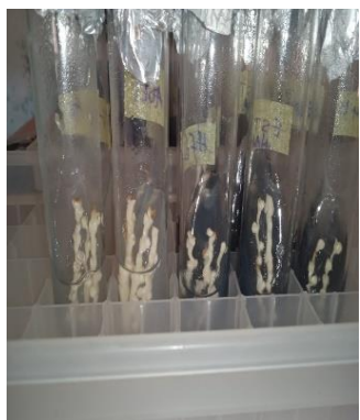
A- Inflorescences explant

Figure 1: Project Flow Chart (A-L are the results obtained from the different stages of responses).