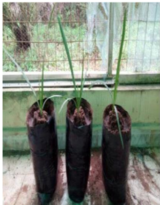
J- Hardening plants