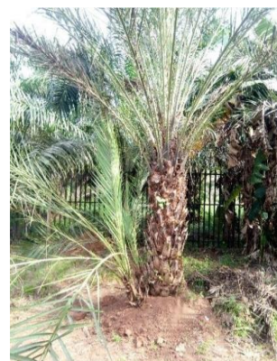
L- Fruiting and suckering palm