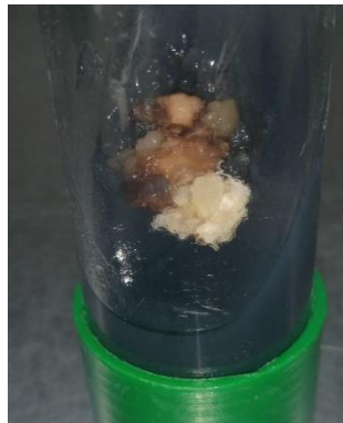
D- Direct somatic embryo